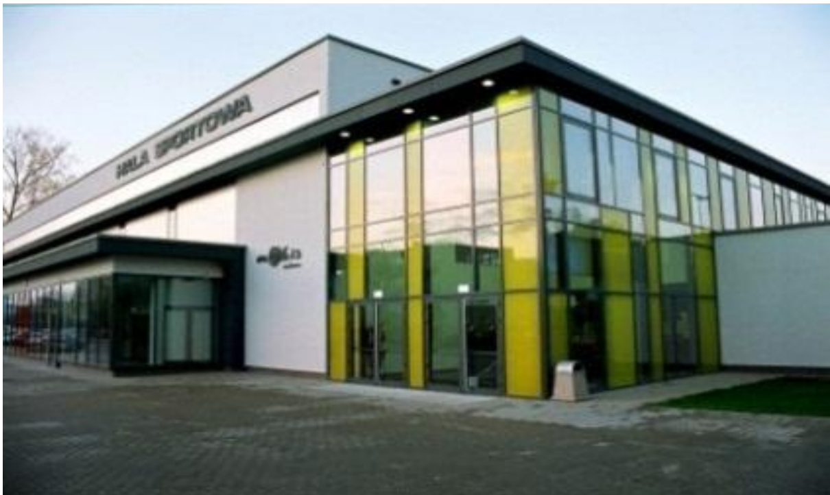
SPORT CENTER, METROLOG Sp. z o.o., Oleśnica 2009