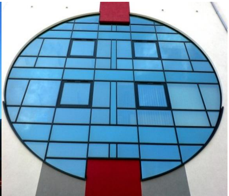
COMMERCIAL & RESIDENTIAL BUILDING Warszawska 49 Kielce 2010

ul. Domaniówka 1 C, 25-413 Kielce, POLAND ul. Warszawska 49 / 44, 25-531 Kielce, POLAND