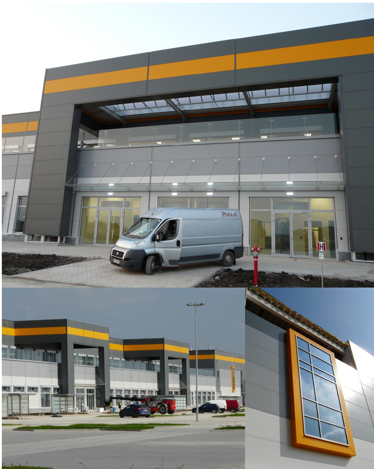
AMAZON Bielany Wrocławskie / Wrocław 2014

ul. Domaniówka 1 C, 25-413 Kielce, POLAND ul. Warszawska 49 / 44, 25-531 Kielce, POLAND