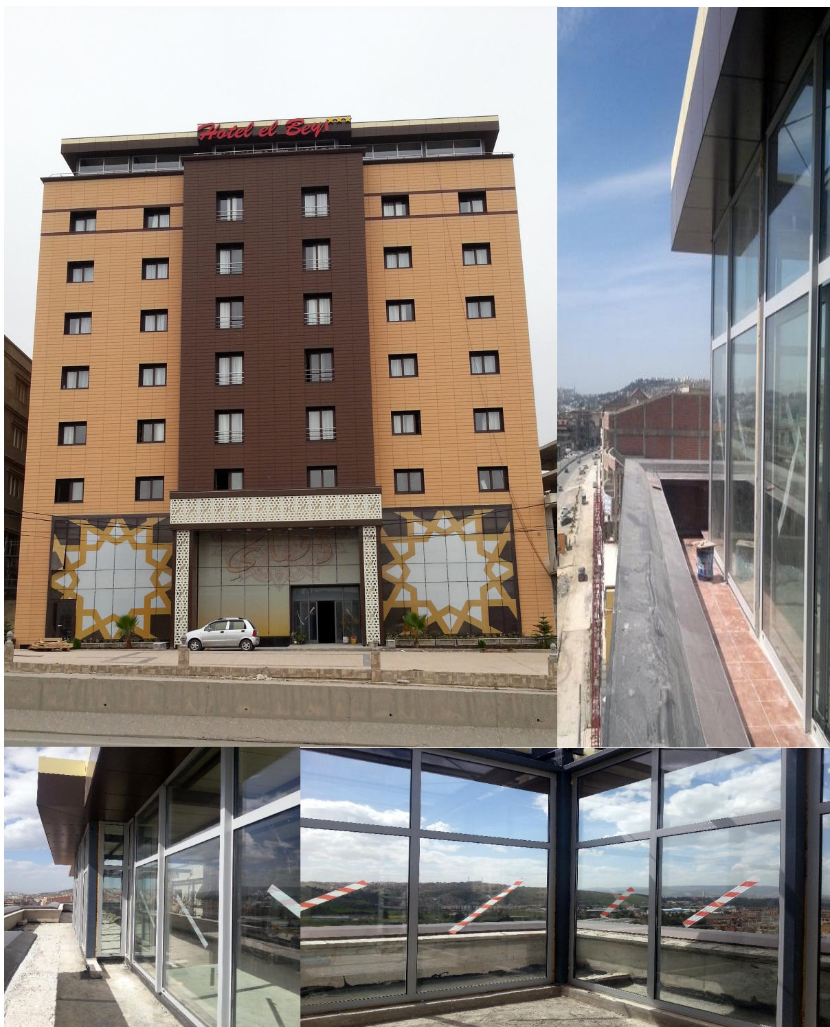
HOTEL Algeria 2014-2015

ul. Domaniówka 1 C, 25-413 Kielce, POLAND ul. Warszawska 49 / 44, 25-531 Kielce, POLAND