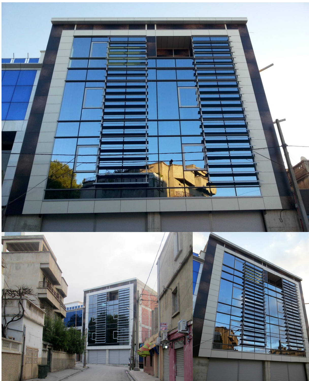
COMMERCIAL BUILDING Algeria 2014-2015

ul. Domaniówka 1 C, 25-413 Kielce, POLAND ul. Warszawska 49 / 44, 25-531 Kielce, POLAND