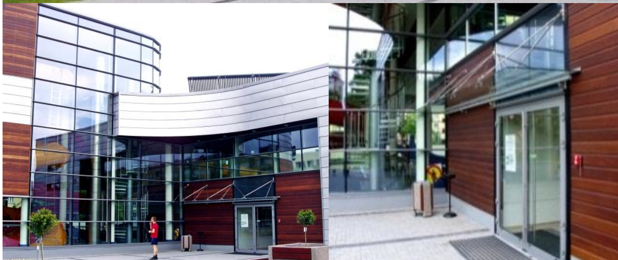
ORKA SWIMMING POOL Bolesławiec 2011

ul. Domaniówka 1 C, 25-413 Kielce, POLAND ul. Warszawska 49 / 44, 25-531 Kielce, POLAND