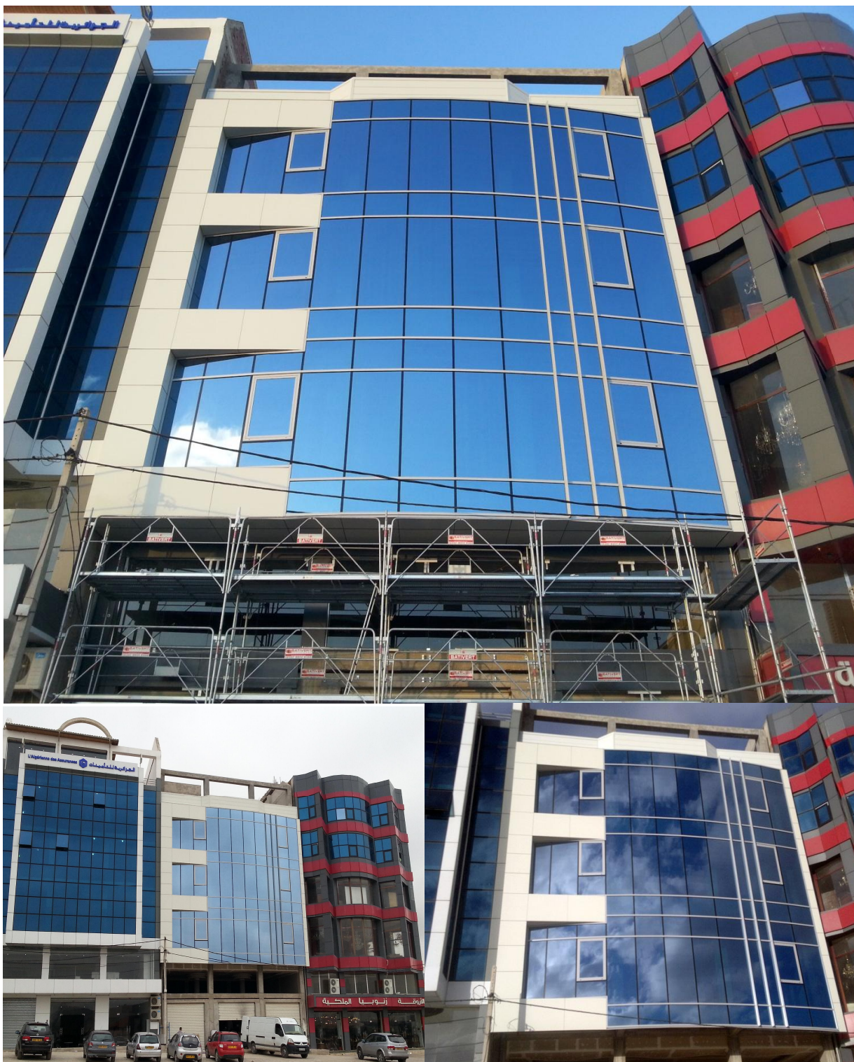
COMMERCIAL BUILDING Algeria 2014-2015

ul. Domaniówka 1 C, 25-413 Kielce, POLAND ul. Warszawska 49 / 44, 25-531 Kielce, POLAND