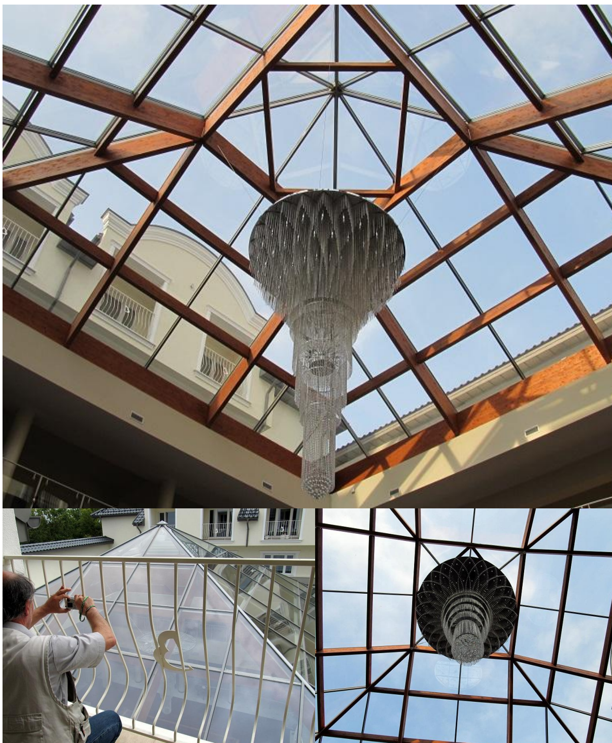
BINKOWSKI HOTEL Kielce 2012-2013

ul. Domaniówka 1 C, 25-413 Kielce, POLAND ul. Warszawska 49 / 44, 25-531 Kielce, POLAND