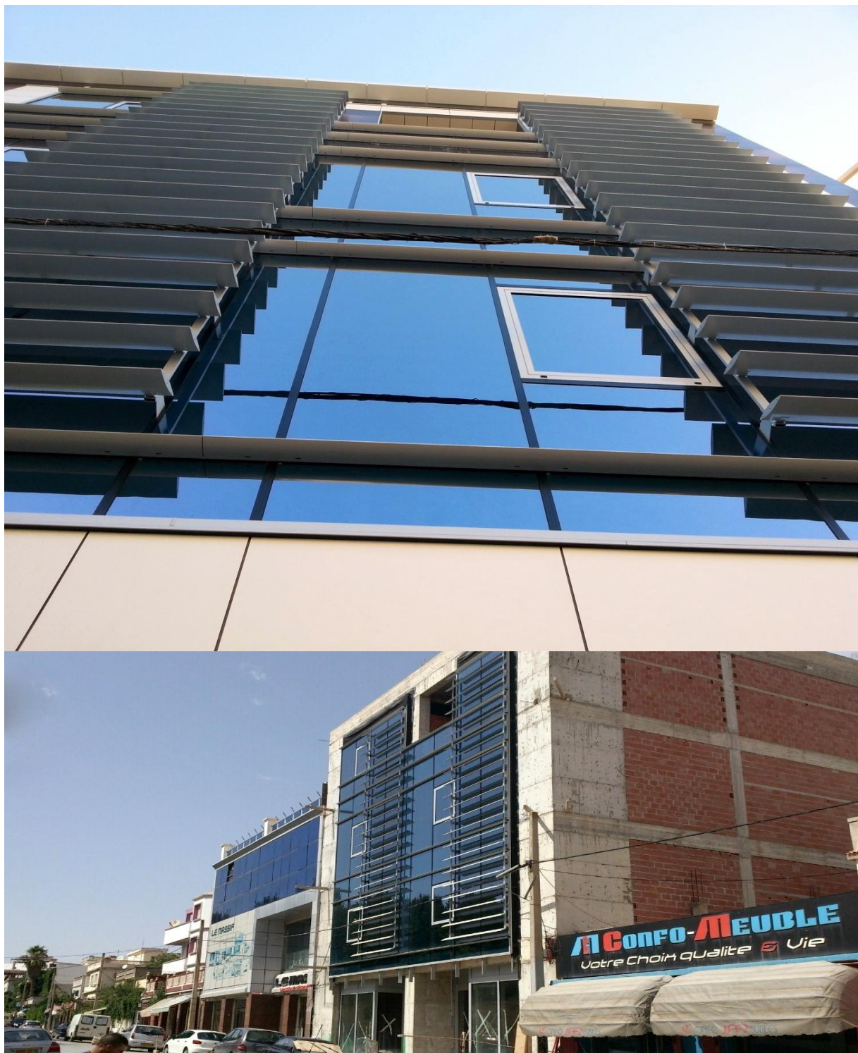
COMMERCIAL BUILDING Algeria 2014-2015

ul. Domaniówka 1 C, 25-413 Kielce, POLAND ul. Warszawska 49 / 44, 25-531 Kielce, POLAND