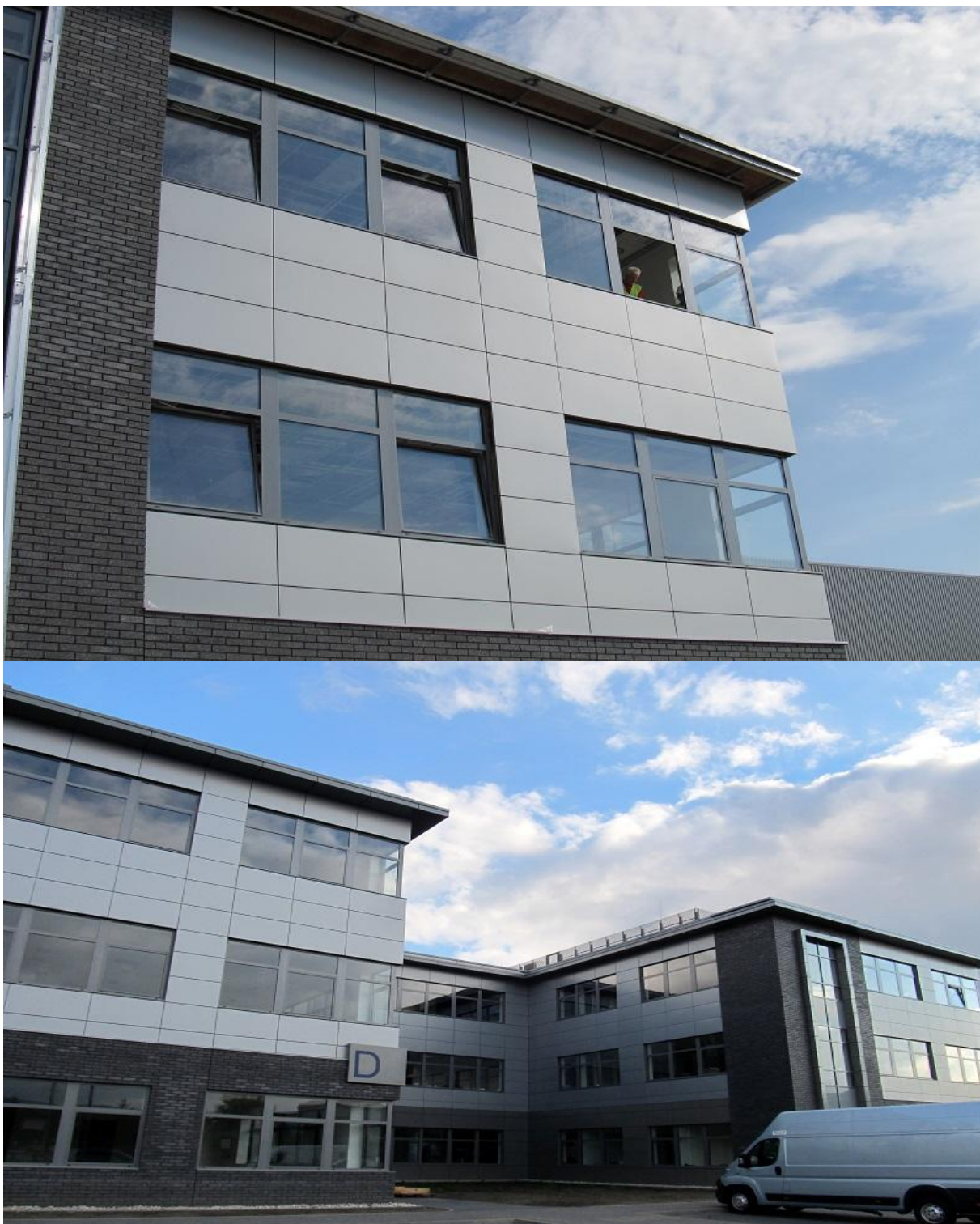
DIAMOND BUSINESS PARK Ursus / Warszawa 2015

ul. Domaniówka 1 C, 25-413 Kielce, POLAND ul. Warszawska 49 / 44, 25-531 Kielce, POLAND