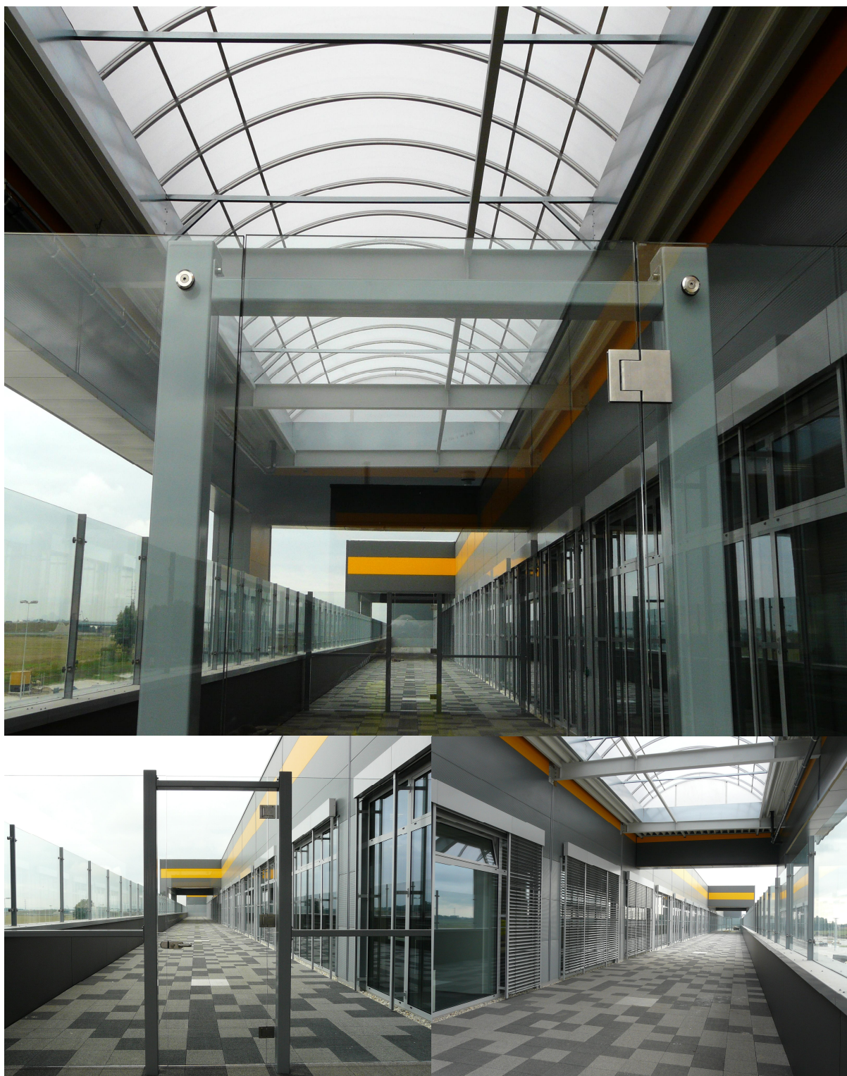
AMAZON Bielany Wrocławskie / Wrocław 2014

ul. Domaniówka 1 C, 25-413 Kielce, POLAND ul. Warszawska 49 / 44, 25-531 Kielce, POLAND