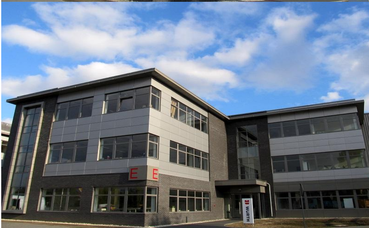
DIAMOND BUSINESS PARK Ursus / Warszawa 2015

ul. Domaniówka 1 C, 25-413 Kielce, POLAND ul. Warszawska 49 / 44, 25-531 Kielce, POLAND