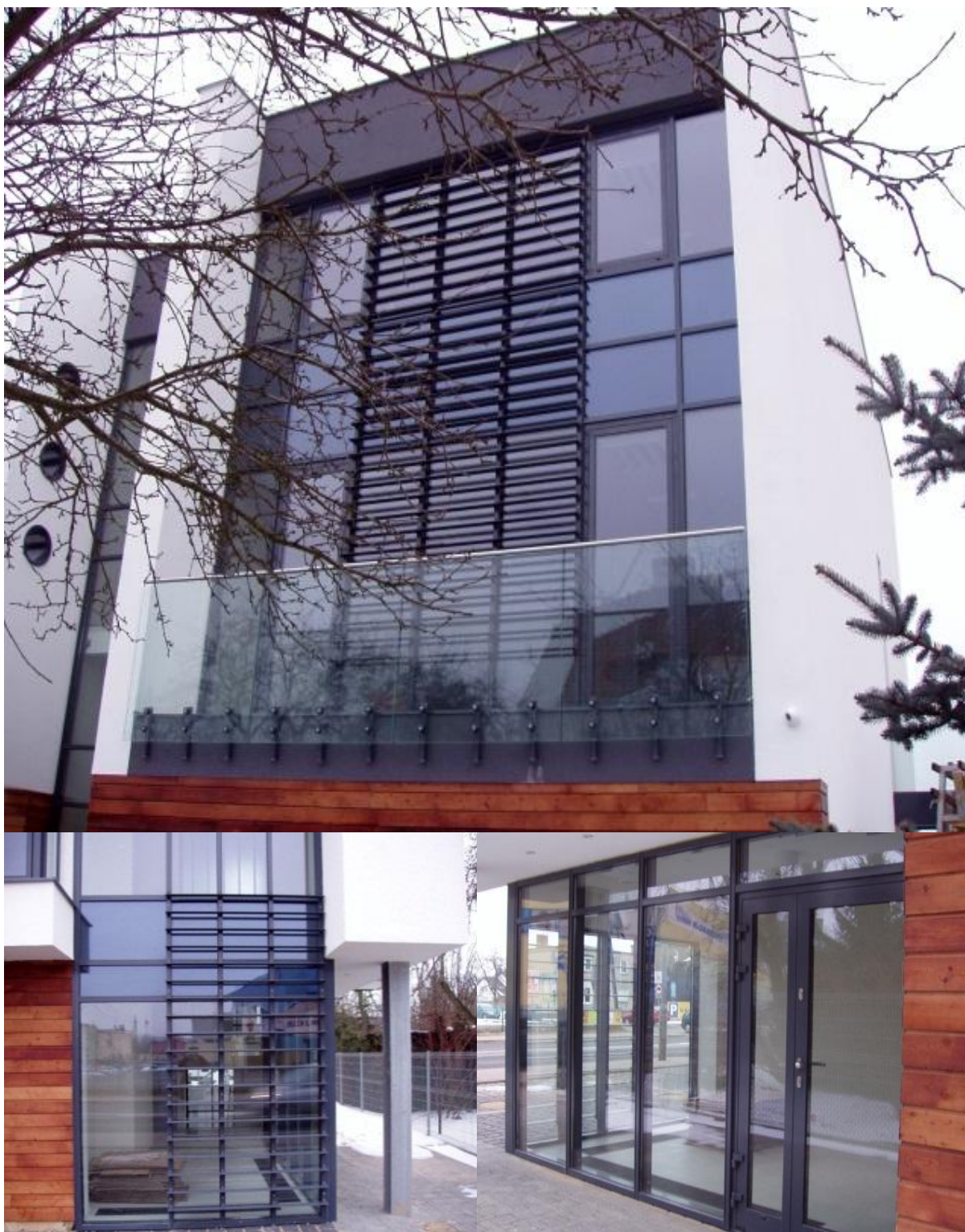
METROLOG Poznań 2012

ul. Domaniówka 1 C, 25-413 Kielce, POLAND ul. Warszawska 49 / 44, 25-531 Kielce, POLAND