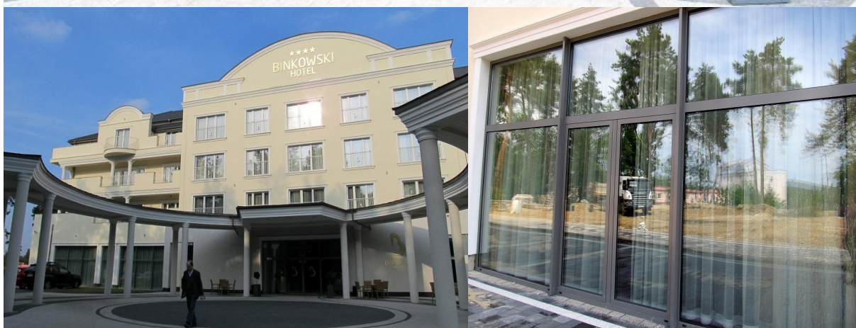
BINKOWSKI HOTEL Kielce 2012-2013

ul. Domaniówka 1 C, 25-413 Kielce, POLAND ul. Warszawska 49 / 44, 25-531 Kielce, POLAND