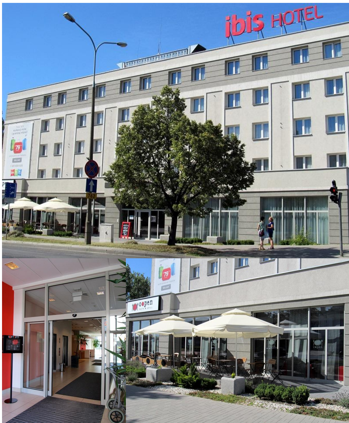
IBIS HOTEL, Kielce 2008

ul. Domaniówka 1 C, 25-413 Kielce, POLAND ul. Warszawska 49 / 44, 25-531 Kielce, POLAND