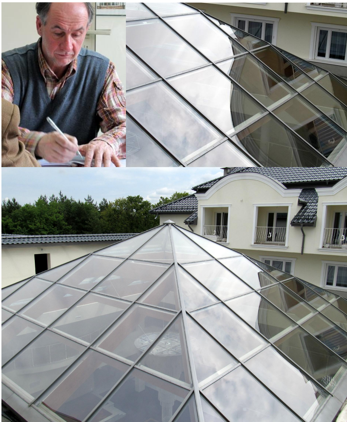
BINKOWSKI HOTEL Kielce 2012-2013

ul. Domaniówka 1 C, 25-413 Kielce, POLAND ul. Warszawska 49 / 44, 25-531 Kielce, POLAND