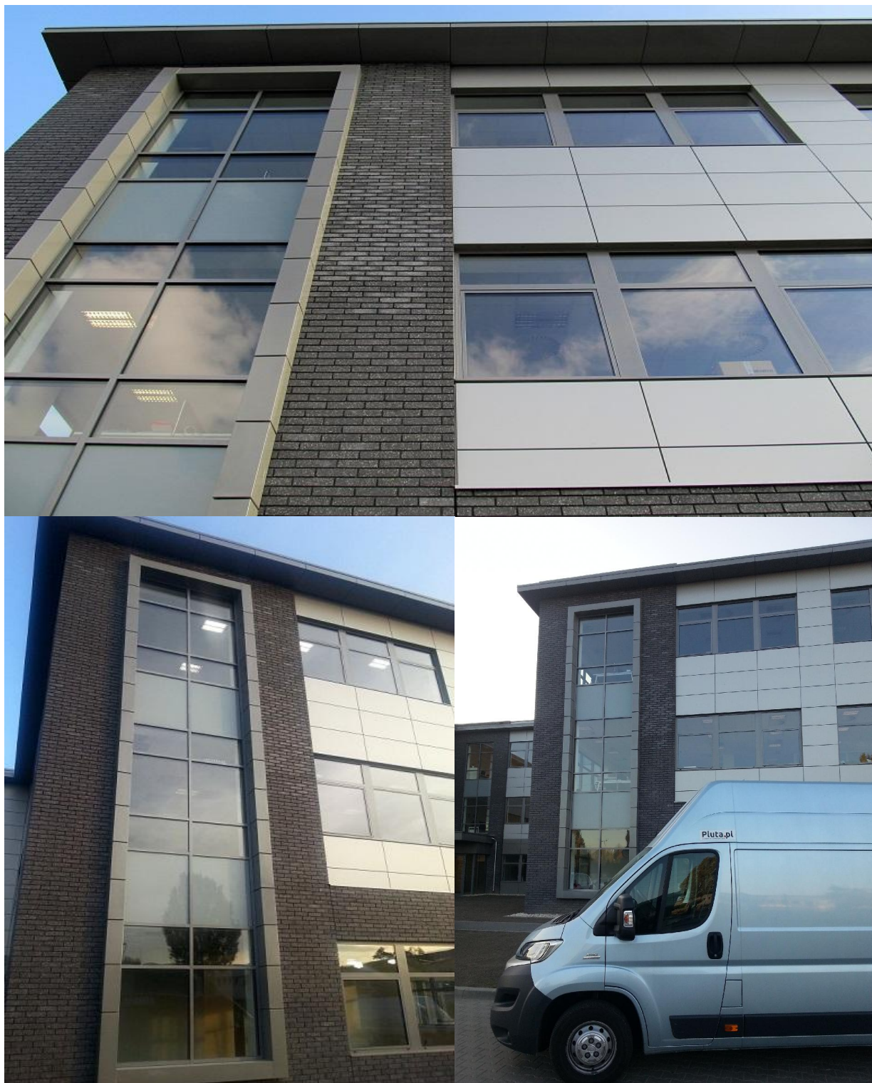
DIAMOND BUSINESS PARK Ursus / Warszawa 2015

ul. Domaniówka 1 C, 25-413 Kielce, POLAND ul. Warszawska 49 / 44, 25-531 Kielce, POLAND