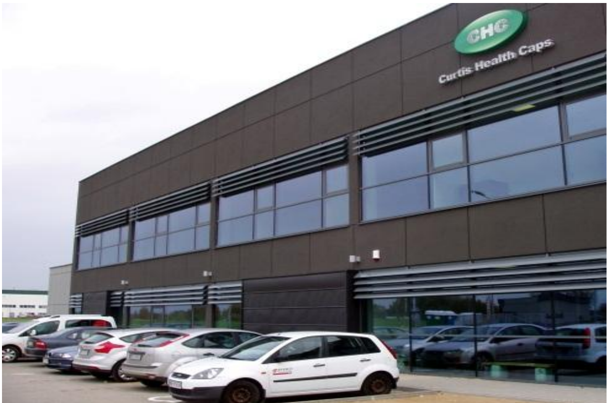
CHC CURTIS HEALTH CUPS Wysogotowo / Poznań 2011

ul. Domaniówka 1 C, 25-413 Kielce, POLAND ul. Warszawska 49 / 44, 25-531 Kielce, POLAND