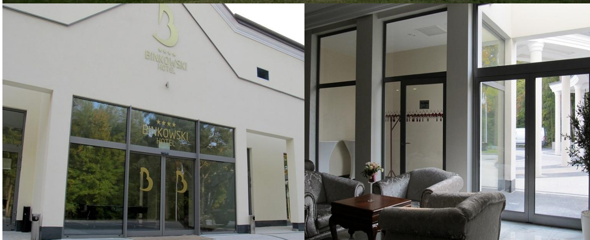
BINKOWSKI HOTEL Kielce 2012-2013

ul. Domaniówka 1 C, 25-413 Kielce, POLAND ul. Warszawska 49 / 44, 25-531 Kielce, POLAND