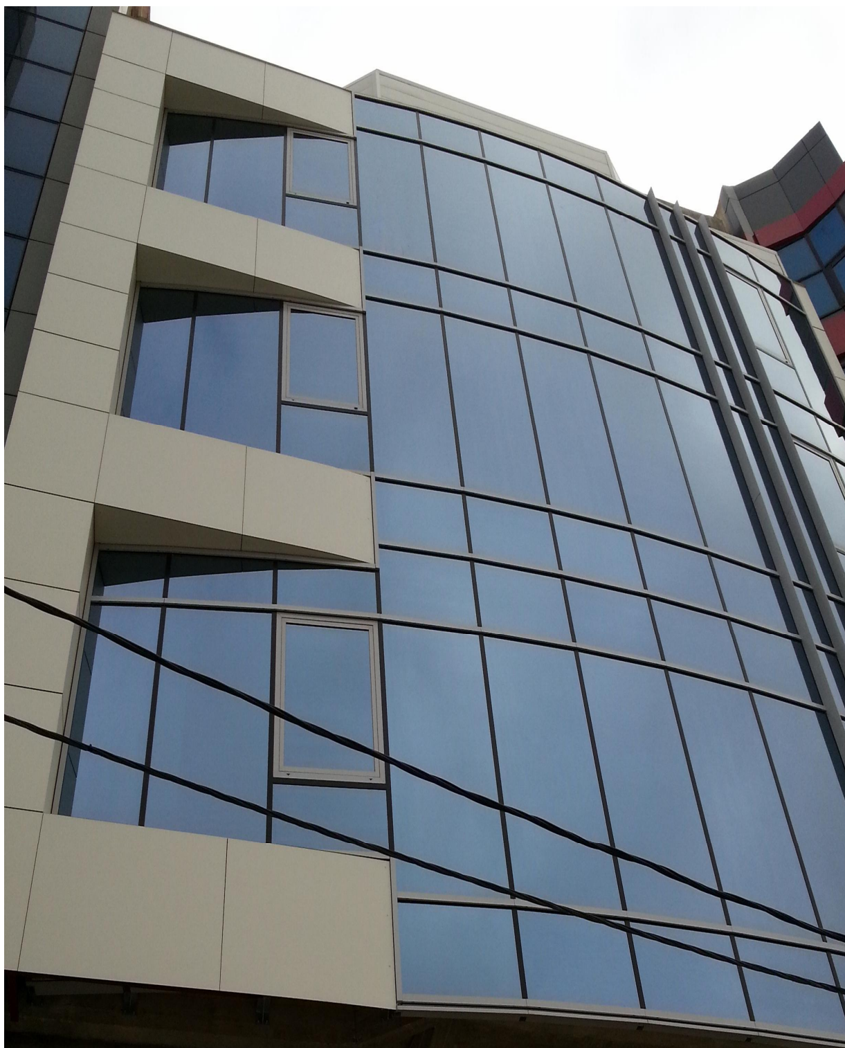
COMMERCIAL BUILDING Algeria 2014-2015

ul. Domaniówka 1 C, 25-413 Kielce, POLAND ul. Warszawska 49 / 44, 25-531 Kielce, POLAND