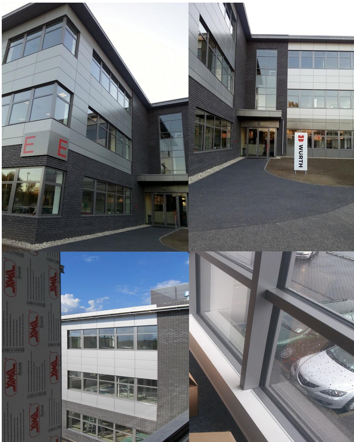
DIAMOND BUSINESS PARK Ursus / Warszawa 2015

ul. Domaniówka 1 C, 25-413 Kielce, POLAND ul. Warszawska 49 / 44, 25-531 Kielce, POLAND