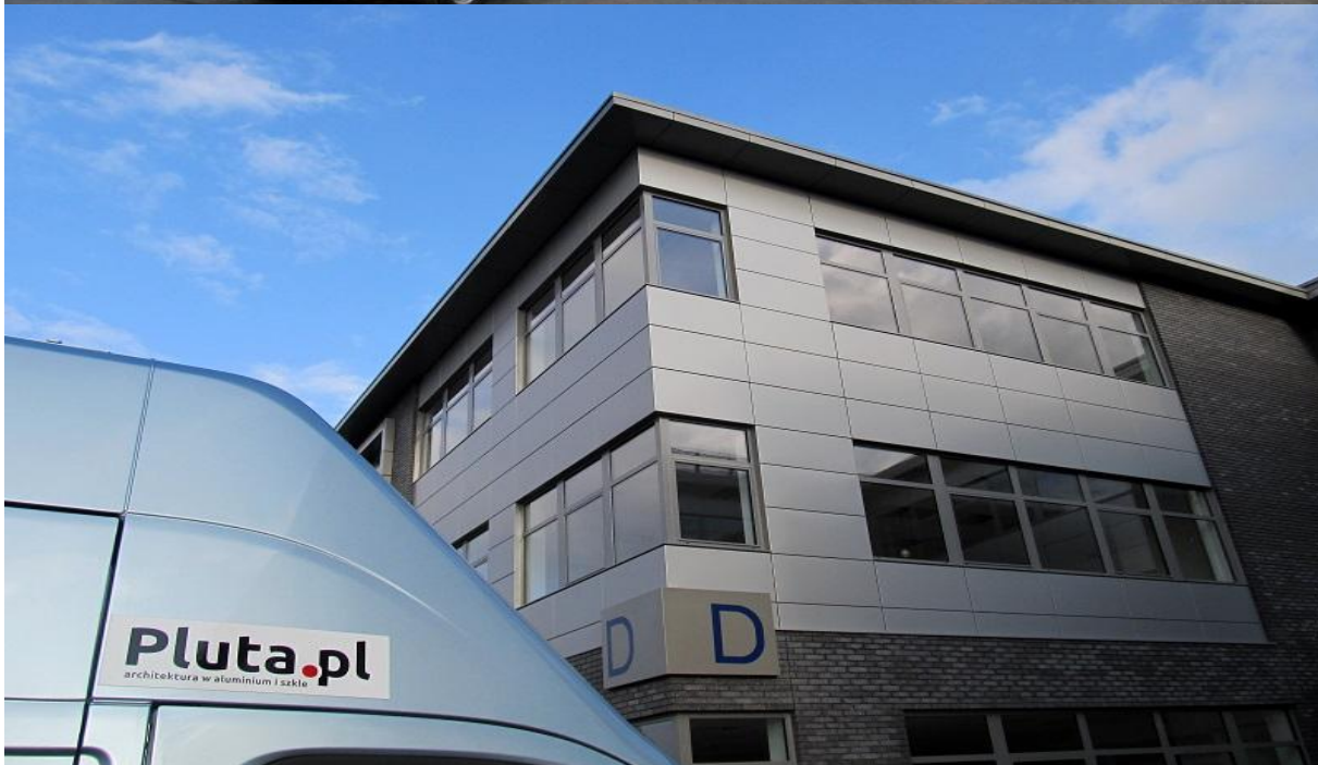
DIAMOND BUSINESS PARK Ursus / Warszawa 2015

ul. Domaniówka 1 C, 25-413 Kielce, POLAND ul. Warszawska 49 / 44, 25-531 Kielce, POLAND